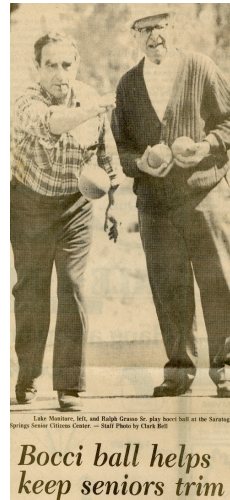
Senior Citizens Center OF SARATOGA SPRINGS, N. Y. INC. 162 Circular St. Saratoga Springs, N. Y.