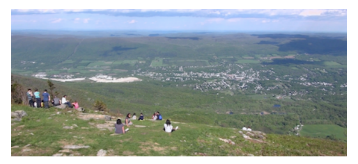
Film still from "Sustaining This Place: Creating a New Hudson Region Landscape"

One of my earlier projects was a film and a book on sustainability in the Hudson River region [Sustaining This Place] (http://www.sustainingthisplace.net/). I envisioned that project being a bridge to my research future, shifting from written materials to film. And so that's been incredibly important to me, that opportunity to make a smooth transition. So now the current film I'm working on is about minimalist and barefoot running. At this point, what I've chosen to feature is a mix between myself, a brand new minimalist runner, and an extremely experienced one, one of the top marathoners in the United States. So in terms of telling a story, I think that'll be the core, but I've also spoken with scientists, podiatrists, MD's, and a ton of different runners from wildly different backgrounds. And so how do I weave their varied stories and sources of information into this story--I haven't worked that out yet.