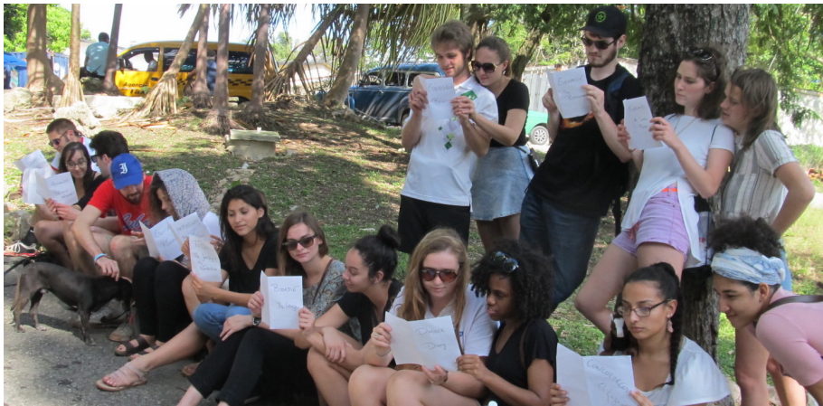
Cuba Travel Seminar: How Was Cuba? ( https://howwascuba.wordpress.com/ )