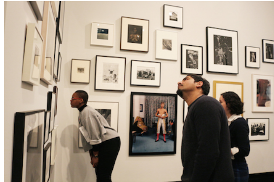
While on campus, the Youth FX team visited exhibits 'Borrowed Light' and 'No Place to Hide' at the Tang Teaching Museum.