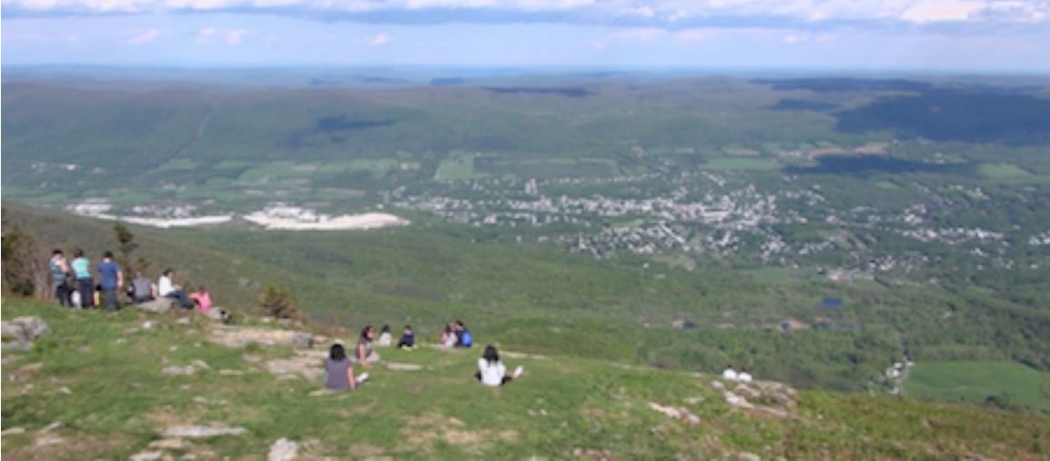
Film still from "Sustaining This Place: Creating a New Hudson Region Landscape"

One of my earlier projects was a film and a book on sustainability in the Hudson River region [Sustaining This Place] ( http://www.sustainingthisplace.net/ ). I envisioned that project being a bridge to my research future, shifting from written materials to film. And so that's been incredibly important to me, that opportunity to make a smooth transition. So now the current film I'm working on is about minimalist and barefoot running. At this point, what I've chosen to feature is a mix between myself, a brand new minimalist runner, and an extremely experienced one, one of the top marathoners in the United States. So in terms of telling a story, I think that'll be the core, but I've also spoken with scientists, podiatrists, MD's, and a ton of different runners from wildly different backgrounds. And so how do I weave their varied stories and sources of information into this story--I haven't worked that out yet.