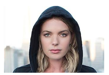
An Apple engineer designed a sweatshirt that's disrupting American Manufacturing American Giant on Business Insider