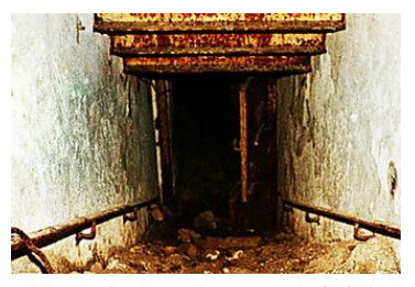
Hitler's Final Bunker Found, Chilling Images Emerge Trend Chaser